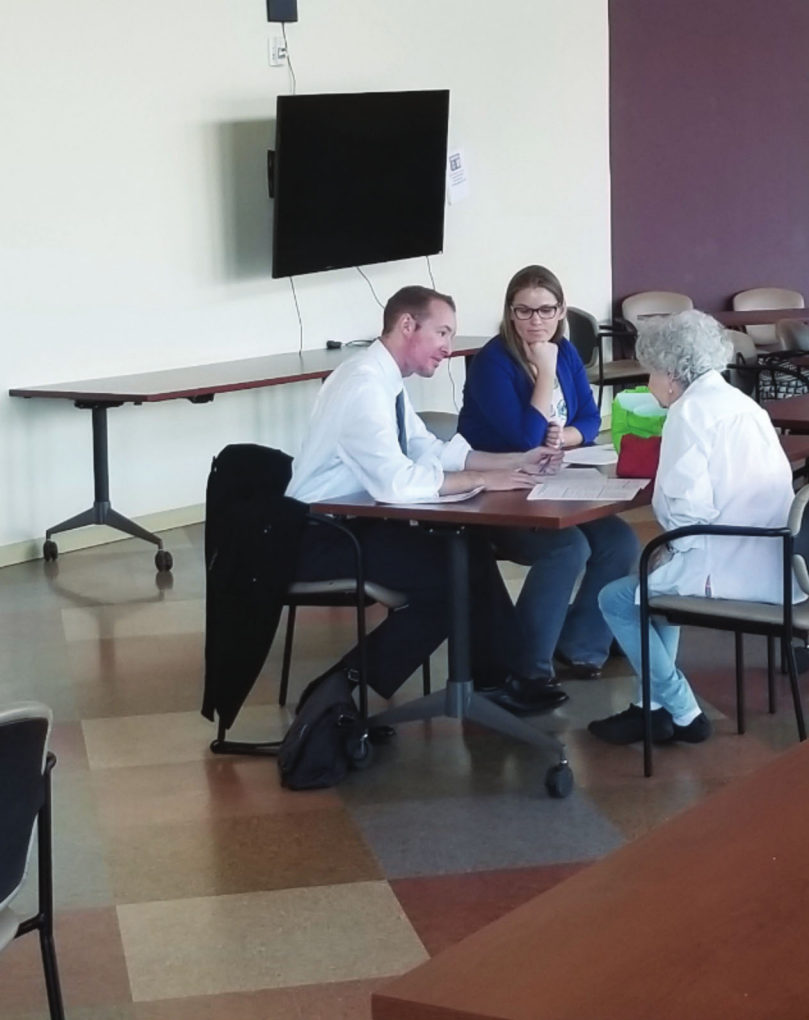
attorneys with referral cases to help attorneys give