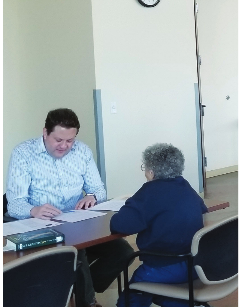
legal services each year. MVL runs clinics and connects

MVL serves two communities: (1) low-income clients in need of legal assistance, and (2) members of the legal community. MVL serves the clients by providing them with access to justice and assistance with their legal issues. MVL serves the legal community by providing opportunities to volunteer and give back to the community. As attorneys we are in a unique position to contribute a service to the community that others cannot provide. Following C.R.C.P Rule 6.1, every lawyer has a professional responsibility to provide legal services to those unable to pay. The Colorado Supreme Court encourages lawyers and firms to render at least fifty hours of pro bono public